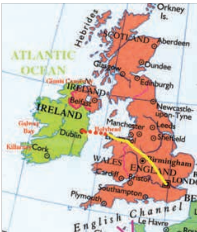
Virgin train en route to Holyhead