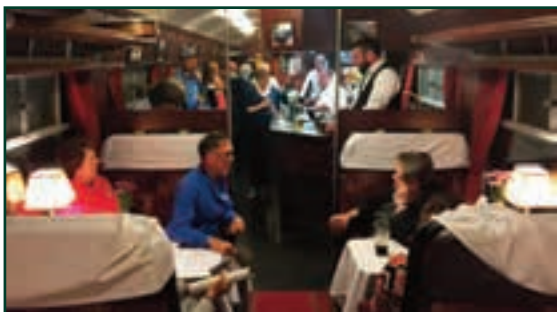
Interior of Emerald Isle Express