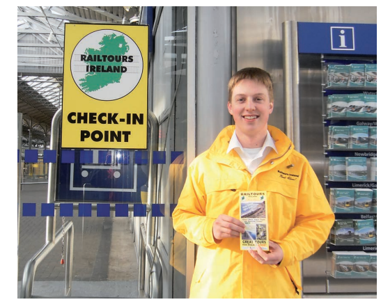
Check-In Point at Dublin Heuston Station. Our staff wear bright yellow jackets at station Check-Ins.

larnród Éireann/CIE is not responsible or liable for the accuracy of any information, data or opinion or statements made on this promotional material/website. larnród Éireann/CIE disclaims all liability which might arise out of, or in connection with the use or reliance on the content or performance of, or information on or services provided on or through this promotional material/website.