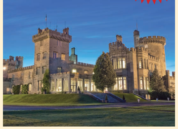
Dromoland Castle, Co. Clare

We offer an exclusive rail cruise through Ireland in a private special heritage train and overnighting in five star Irish Castle, city and country hotels. This exclusive tour is limited to 50 guests and will include – Dublin, Waterford, Cork, Cobh, Killarney, The Ring of Kerry, Cliffs of Moher, Bunratty Castle Medieval