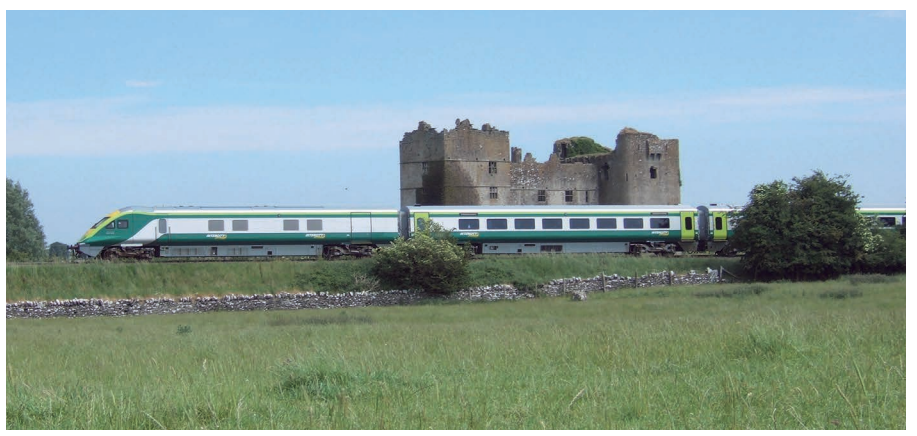
State-of-the-art Irish Rail and picturesque castle in the Irish countryside.

IMPORTANT NOTICE – On any tour to Belfast or The Giant's Causeway you will be leaving the Republic of Ireland and entering the United Kingdom and Northern Ireland. Please ensure that your visa requirements are in order, and it is essential that you carry your passport.