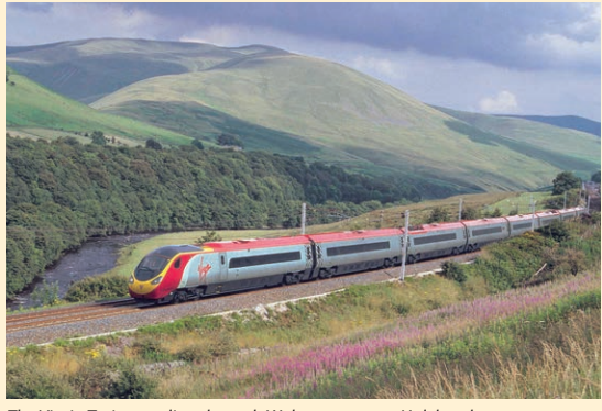
The Virgin Train traveling through Wales en route to Holyhead.

4 day tour with 3 nights in Dublin. Travel from London through England/Wales by Virgin Trains, cross the Irish Sea with Irish Ferries, and enjoy Dublin with Railtours Ireland.