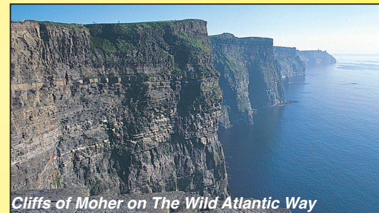
Cliffs of Moher on The Wild Atlantic Way