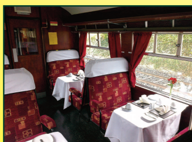
Interior of Emerald Isle Express