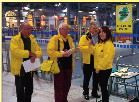
Check-In Dublin Heuston Station

DUBLIN CHECK IN TIME IS 20 MINUTES BEFORE DEPARTURE