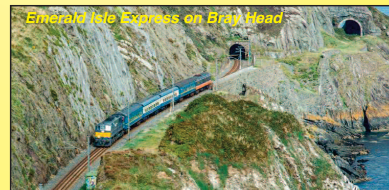
Emerald Isle Express on Bray Head